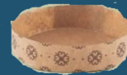
FORMA P/ QUICHE Q-8 Q-10