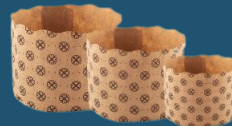
FORMA P/ PANETONE