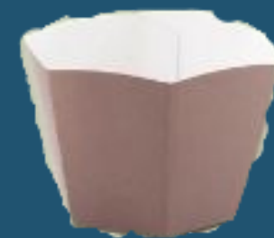
FORMA P/ CUP CAKE F-CUP