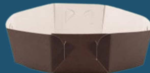
FORMA P/ PÃO DE LÓ FP-14 FP-16 FP-18