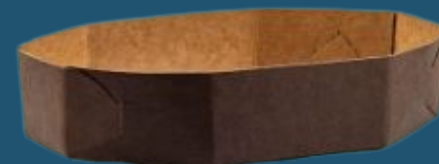
FORMA P/ COLOMBA PASCAL FC-500