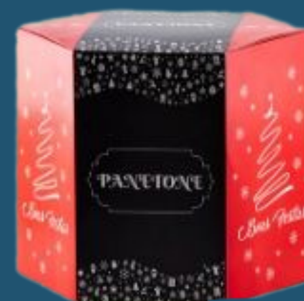
CAIXA P/ PANETONE